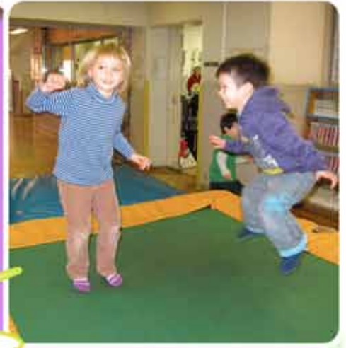
Trampoline is a rare treat, isn't it!!