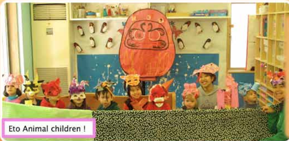
Eto Animal children !