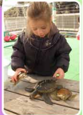
The children came up with the most fascinating games !